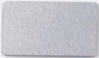
HR021 BRIGHT SILVER