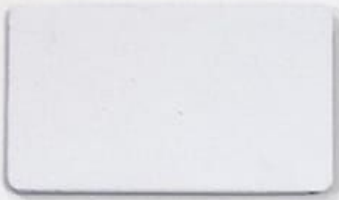
HR011 WHITE GLOSE