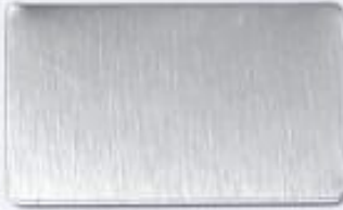
HR023 SILVER BRUSHED