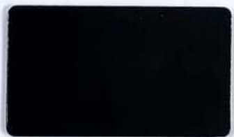
HR081 BLACK GLOSE