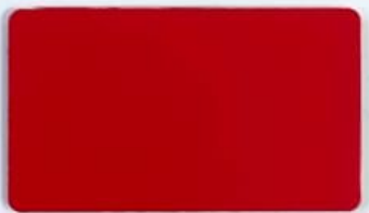
HR032 RED MAT