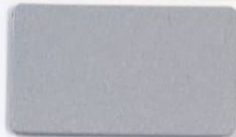
HR022 SILVER MAT