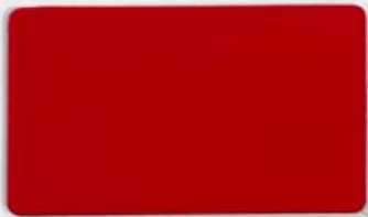
HR031 RED GLOSE