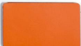
HR042 ORANGE MAT