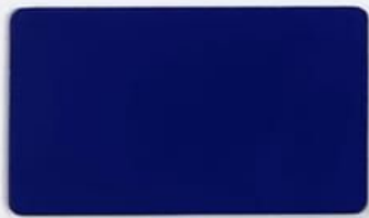
HR051 BLUE MAT