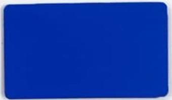
HR052 BLUE GLOSE