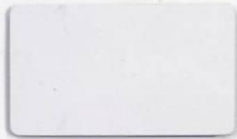
HR012 WHITE MAT