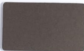
HR080 BROWN GLOSE