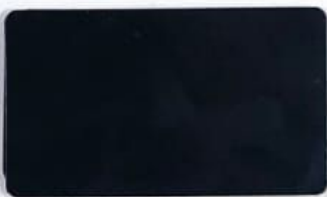
HR082 BLACK MAT