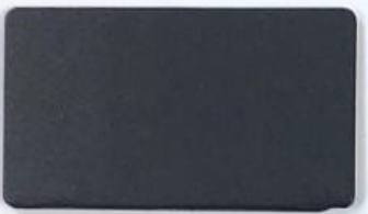
HR025 DARK GRAY