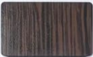
HR091 WOOD 712