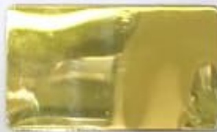
HR01016 Gold Mirror