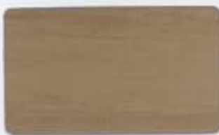
HR092 WOOD FC3